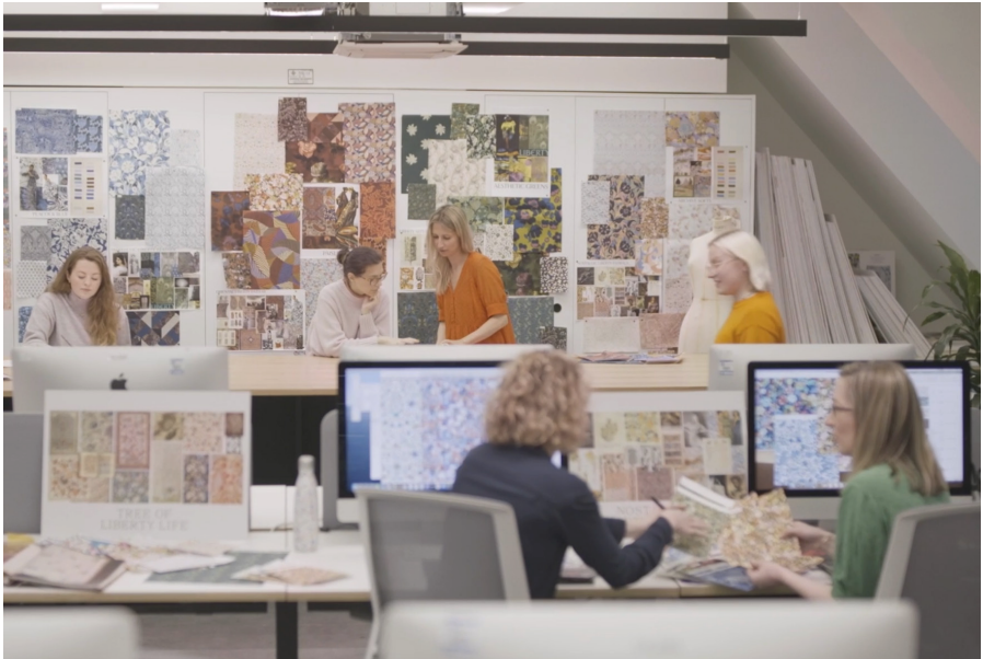
Liberty Design Studio