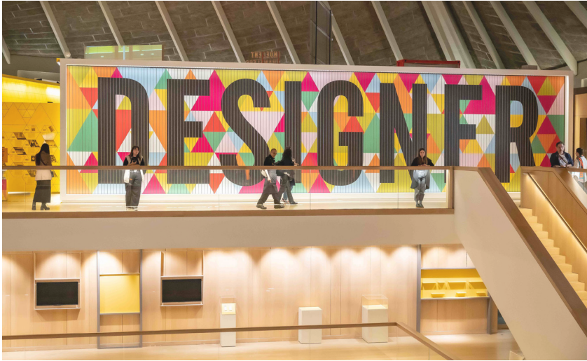
Design Museum interior, London, 2024