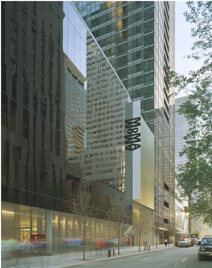
The David and Peggy Rockefeller Building (foreground) and Museum Tower.

We have so much to look forward to in 2025! The calendar is already filling up fast on the back of a busy, productive, and rewarding 2024 for The World Around and its partner organizations and institutions.