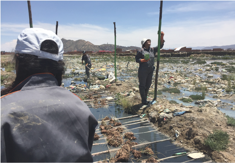
Uru Uru Lake